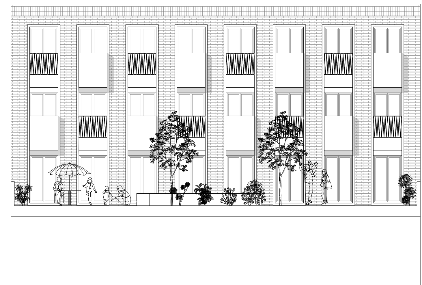
Proposed Inner South Elevation 1:100 0 1 2 3 4 5