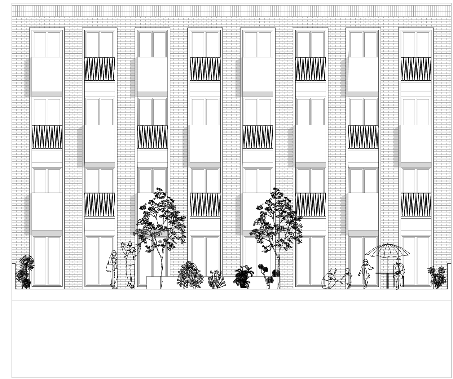
Proposed Inner North Elevation 1:100 0 1 2 3 4 5